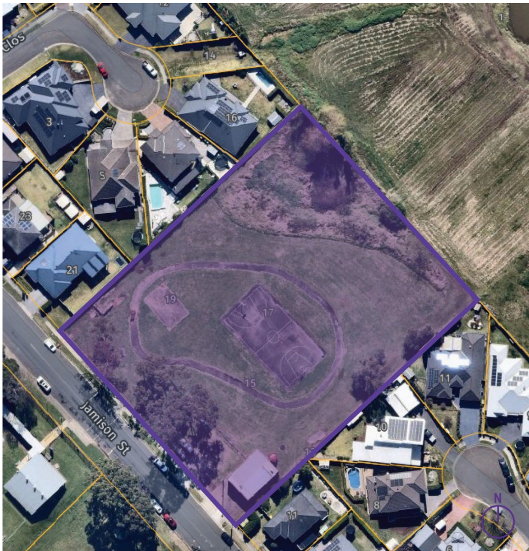
General Community Use

Given other uses of the reserve the PoM may explore future categories of Park and Sportsground that cover the sports court and open grassed areas.