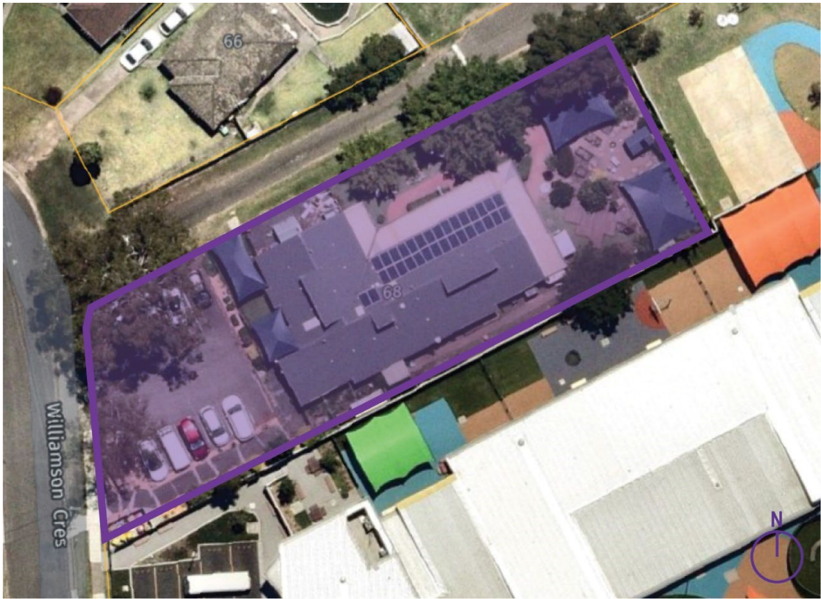
General Community Use

This reserve is occupied by WARWICK FARM EARLY EDUCATION AND CARE CENTRE building and external playground space and has been long-established as an early education centre which supports the ' General Community Use ' categorisation.