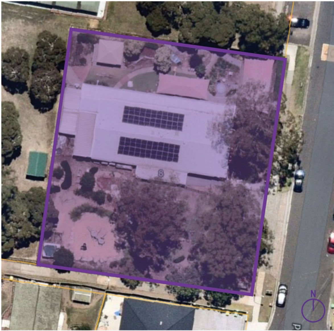
General Community Use

This reserve is occupied by PRESTONS EARLY EDUCATION AND CARE CENTRE building and external playground space and has been long-established as an early education centre which supports the ' General Community Use ' use' categorisation.