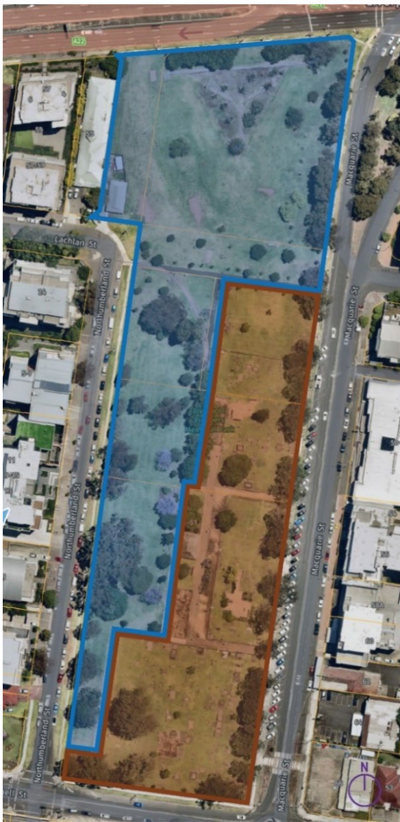
Areas of Cultural Significance Park

This reserve is the paper road sections adjacent to and forms part of the Liverpool Pioneers Memorial Park, which supports the 'Park' categorisation and remaining are 'Area of Cultural Significance'.