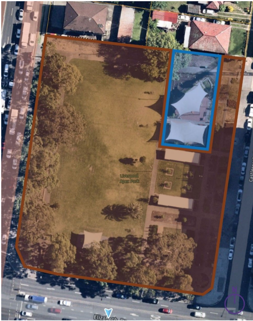
Areas of Cultural Significance Park

The site now known as Apex Park was used as a burial ground during two distinct periods and as such 'Area of Cultural Significance' is applied to areas of the 'Park' including the developed the Aboriginal garden area and steamroller.