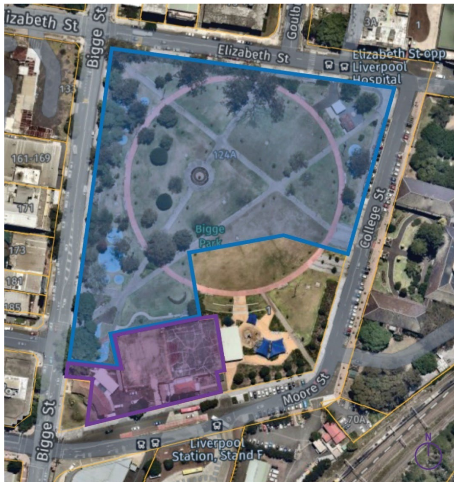
General Community Use Park / Area of Cultural Significance

‘Area of Cultural Significance’ For the purpose of this document, the site has been dually categorised as Park and Area of Cultural Significance.