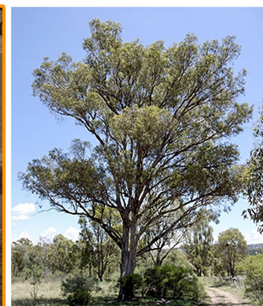
Grey box tree planting to match existing tree species