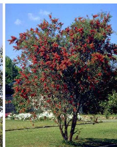
Bottlebrush trees as screening planting