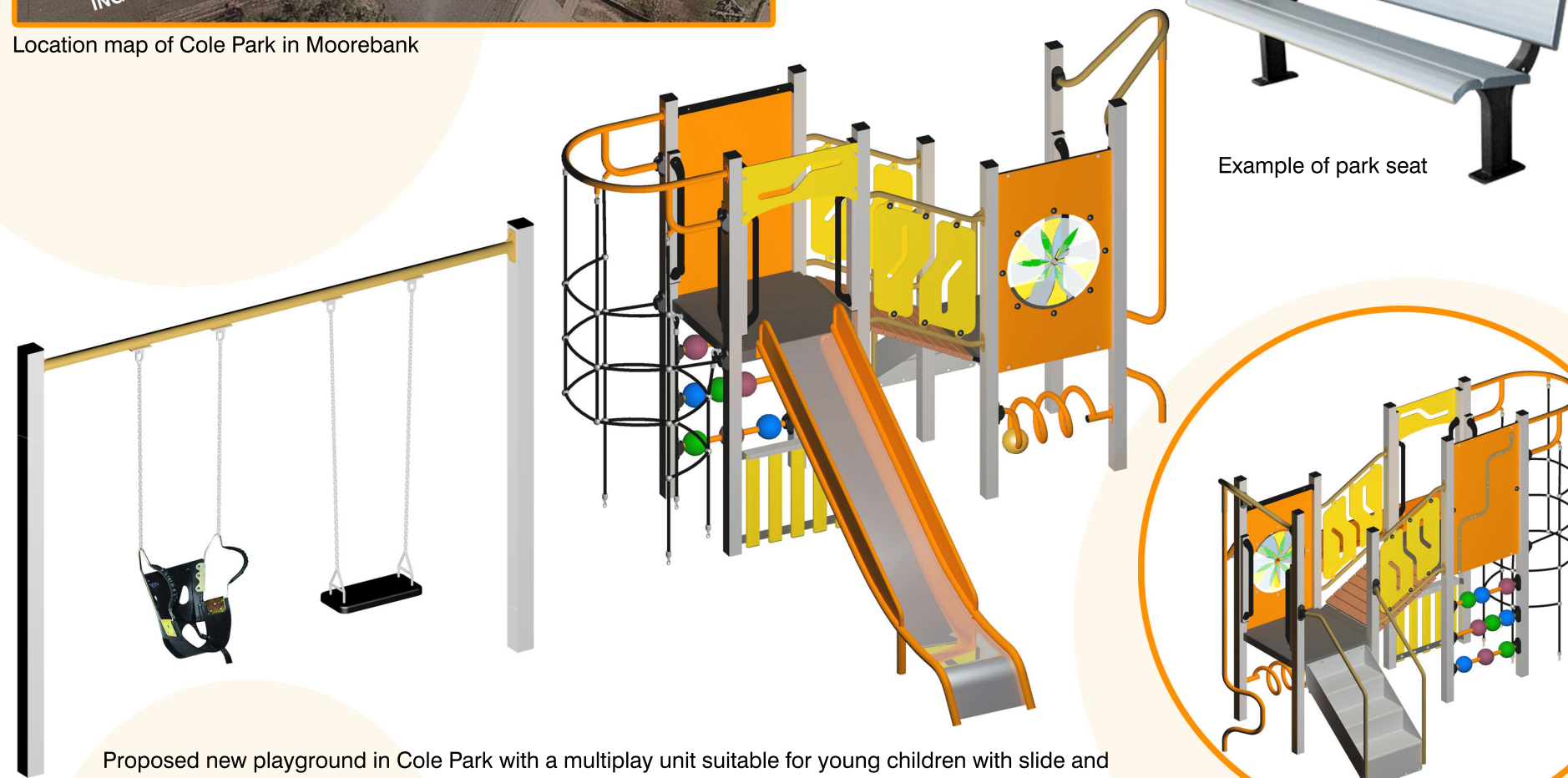
Proposed new playground in Cole Park with a multiplay unit suitable for young children with slide and multiple play panels. The proposed dual swing set is fitted with solid swing seat and inclusive high back swing seat. The entire playground is shaded with a new shade sail structure.