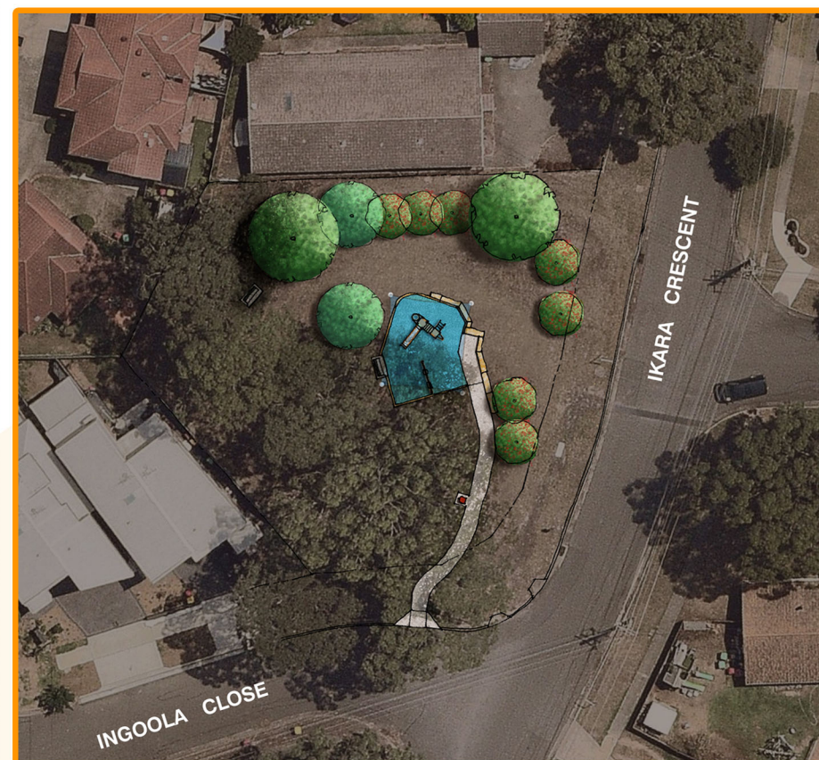
Location map of Cole Park in Moorebank