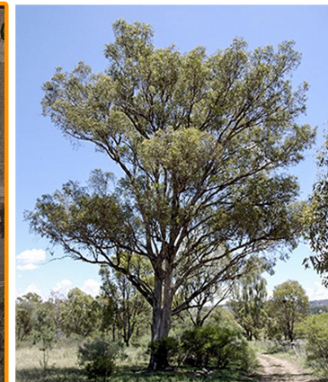
Grey box tree planting to match existing tree species