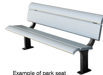
Example of park seat