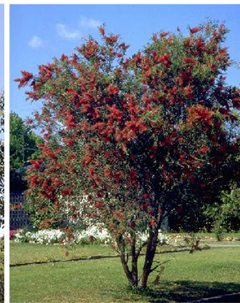
Bottlebrush trees as screening planting