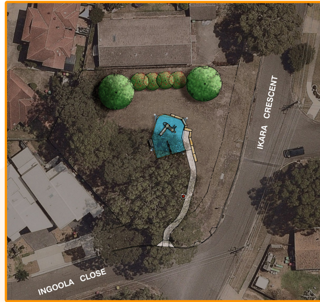
Location map of Cole Park in Moorebank