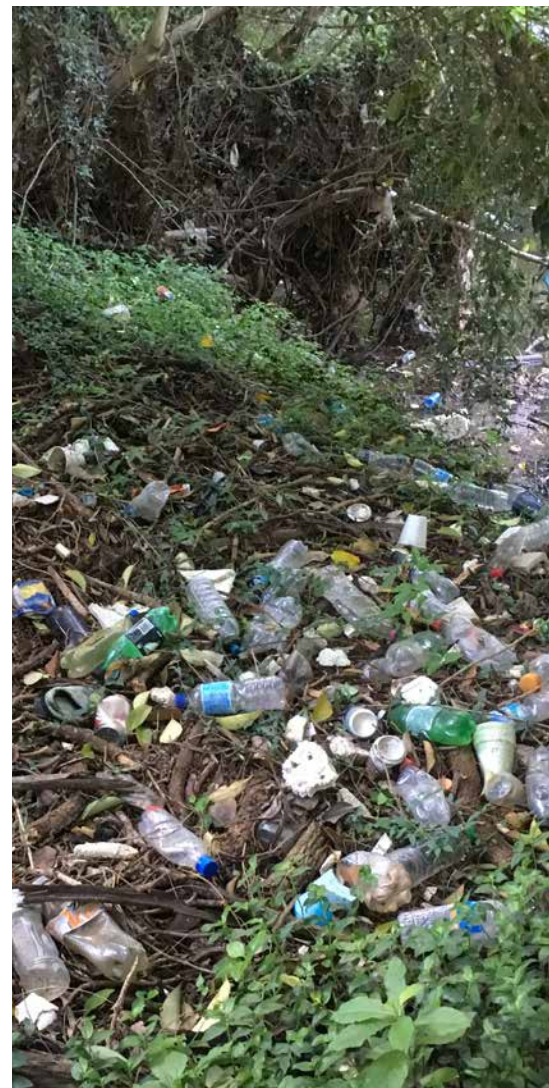
Litter on the banks of Brickmakers Creek, Warwick Farm

For more information, please visit www.liverpool.nsw.gov.au/environment/water-and-waterways/water-quality