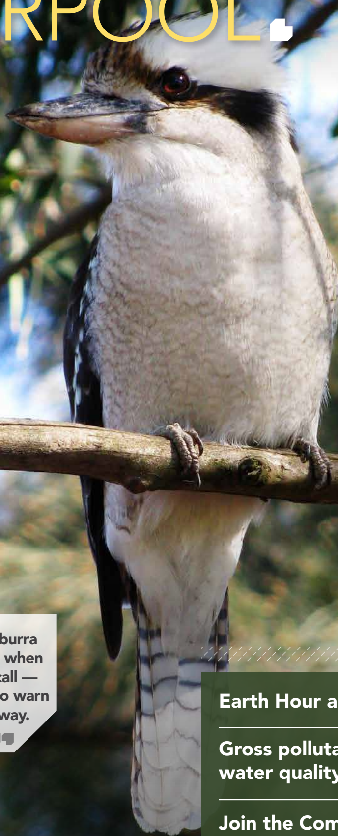
Laughing Kookaburra – Dacelo novaeguineae