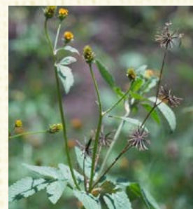
Bidens pilosa flowering stem – Image © Australian National Botanic Gardens

Two test plots were established side-by-side, with the rest of the site acting as a control (i.e. traditional control measures). The trial areas were weeded and mulched to establish a baseline for the treatment. The test plot with treatment had a thin layer of white sugar applied before being mulched. Sugar is reapplied every three months.