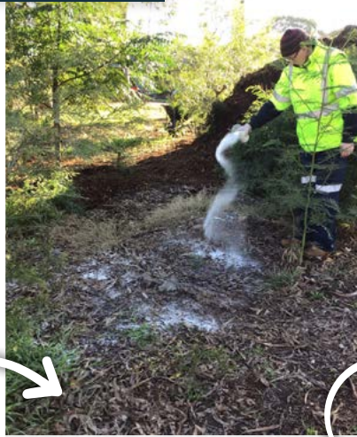
Spreading the sugar after hand weeding the site