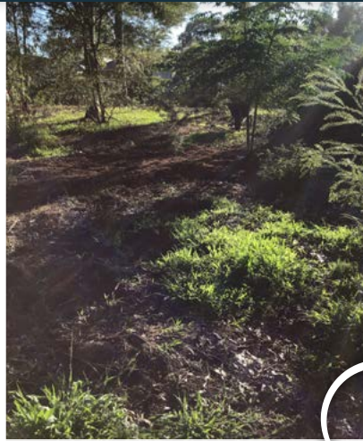
Site covered in weeds before the sugar trial