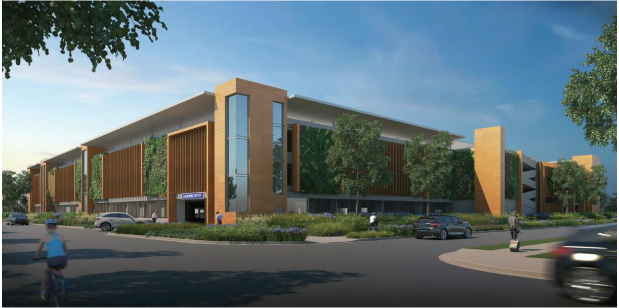
Figure 7 Draft Concept Plan for Collimore Carpark (Perspective View from Corner of Moore St and Collimore Ave)