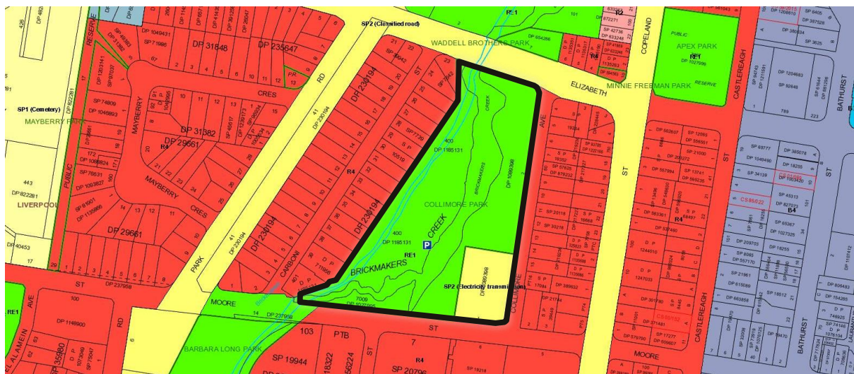
Figure 2: Zoning Map from LLEP 2008 (Subject site outlined in black)

Adjoining the site to the north is Elizabeth Drive and Waddell Brothers Park, with some low density residential dwelling located to the north-east. To the east of Collimore Avenue are a variety of low and medium density residential developments ranging from single storey dwellings to three storey residential flat buildings. A larger residential area is located to the south of Moore Street consisting of a variety of 3-4 storey residential flat buildings. Finally, Brickmakers Creek runs along the western edge of the site, with further low and medium density residential developments located to the west ranging between one and two storeys in height.