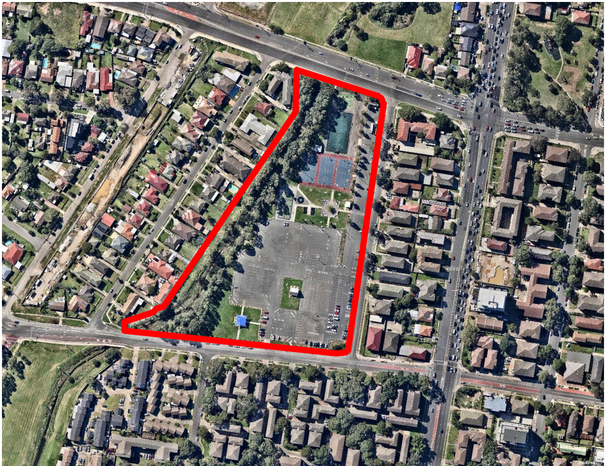
Figure 1: Location of subject site outlined in red

The subject site is located on the western edge of the Liverpool CBD area. The total area of the subject site is approximately 38,500m 2 . The site consists of the following lots, and are owned as follows: