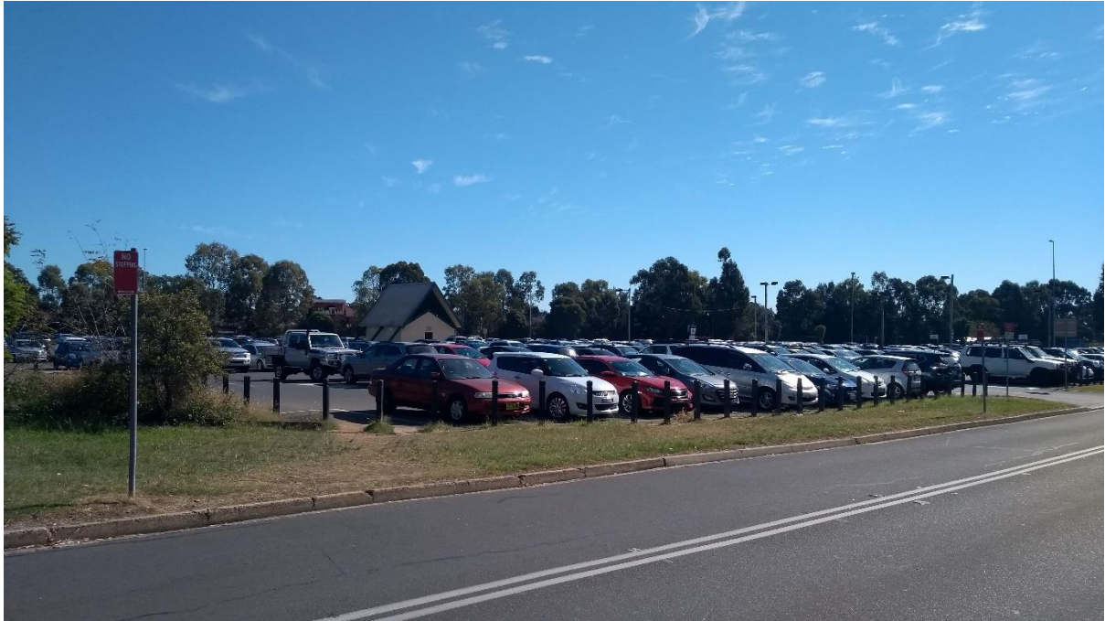
Figure 3 Looking at the subject site in a north-westerly direction from the corner of Moore St and Collimore Ave