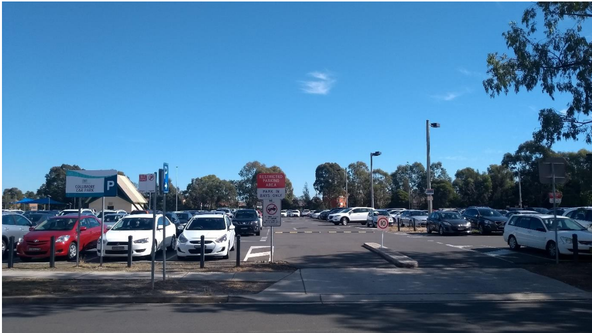
Figure 5 Looking at the subject site from Collimore Ave in a westerly direction