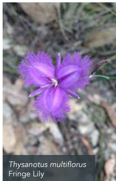
Thysanotus multiflorus Fringe Lily