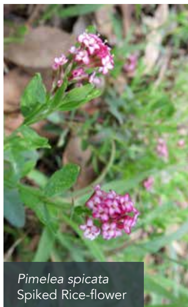
Pimelea spicata Spiked Rice-flower