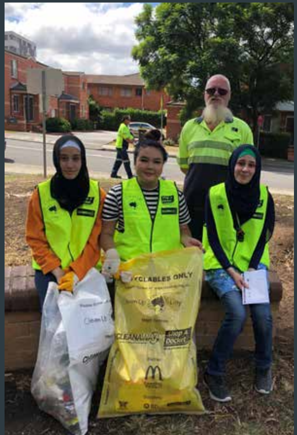
Volunteers from the Muslim Women Welfare of Australia, a community member and Council staff participating on the day

Liverpool City Council would like to congratulate all volunteers for this year's Clean Up Australia Day and thank them for their efforts.