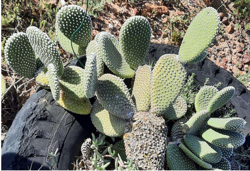
Bunny Ears Cactus.

Bunny Ears Cactus has pairs of pads that are covered in tufts of golden bristles. The pads grow in pairs and look like a pair of rabbit ears. It is usually a low, creeping plant with shallow roots. Bunny Ears Cactus forms dense thickets and: