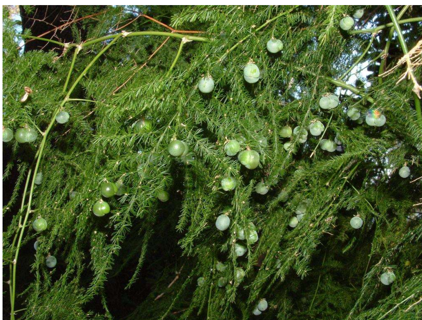
Climbing Asparagus Fern.