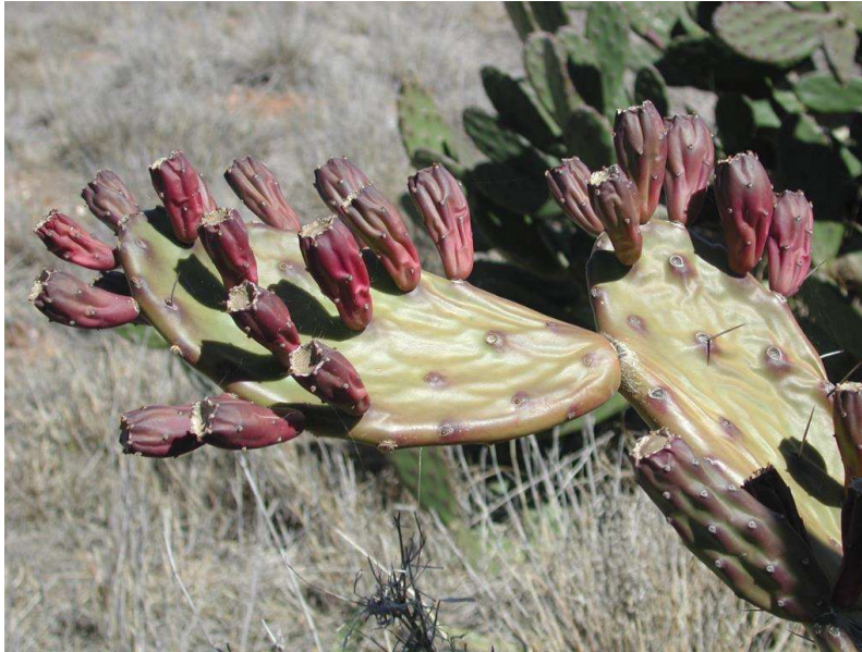
Riverina Pear.

Riverina pear is a branched shrub up to 2 m tall. It is usually erect but sometimes scrambles over the ground and climbs over other plants. Riverina pear is an invasive cactus that: