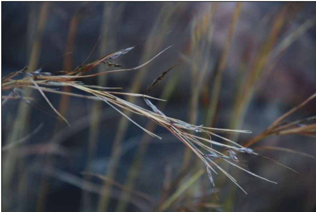
Coolatai Grass.