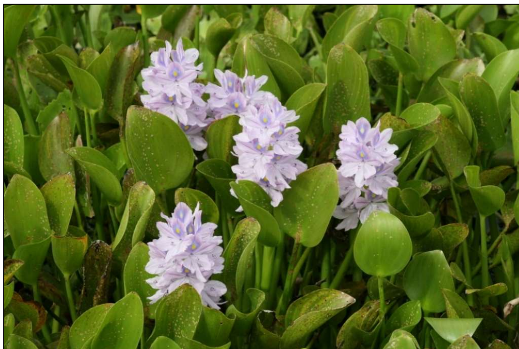
Water Hyacinth.