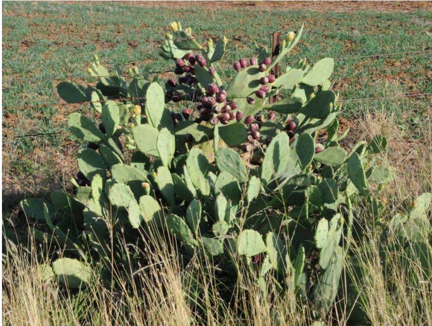
Common Pear.

Common pear is a cactus up to 2 m tall with spines, bristles, yellow flowers and purplish red fruit. It is a WoNS. Common pear can outcompete other plants and form dense infestations. It: