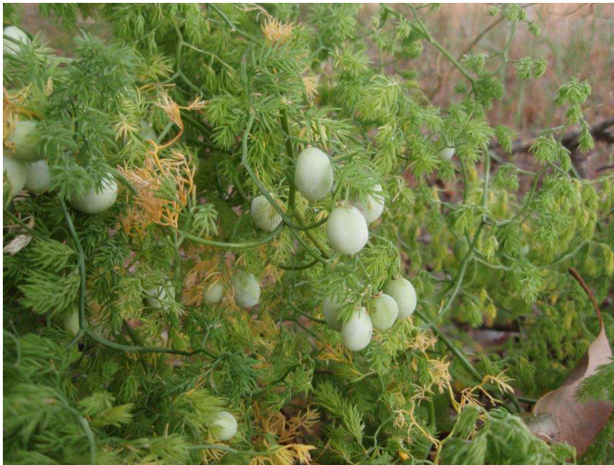
Bridal Veil Creeper.

Bridal Veil Creeper is a fern-like scrambler or low climber with light green, bluish-grey or whitish berries. It quickly outcompetes other plants and could degrade bushland in parts of coastal NSW. Bridal veil creeper can grow very densely at ground and shrub level. It also forms thick tuberous root mats. It is highly invasive and: