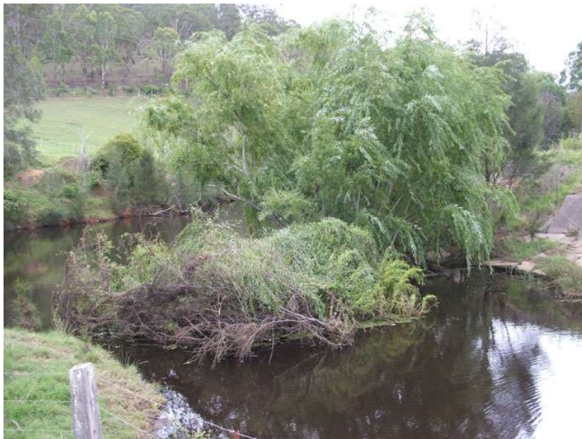
Willow spp..