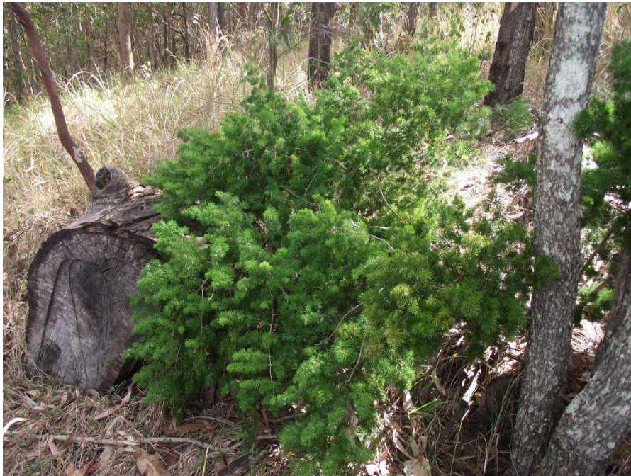
Ming Asparagus Fern.

Ming Asparagus Fern is a shrubby, ornamental plant that has become a potentially serious environmental weed of the eastern and southern Australian coasts. Ming Asparagus Fern has the