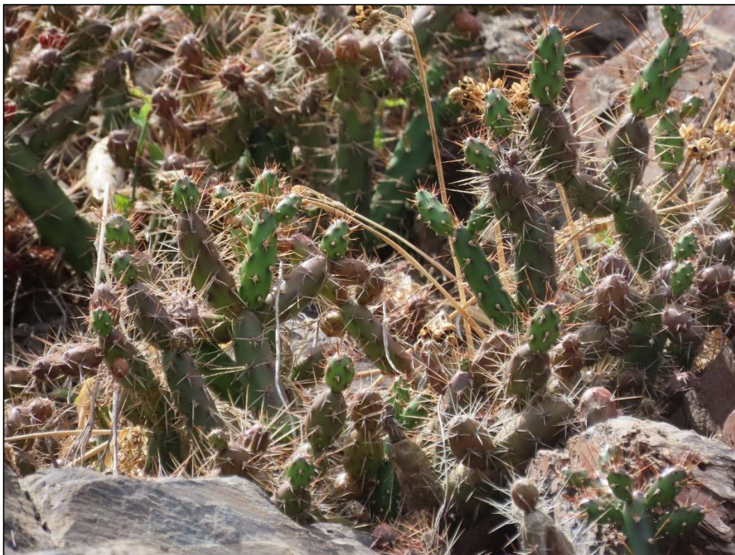
Tiger pear