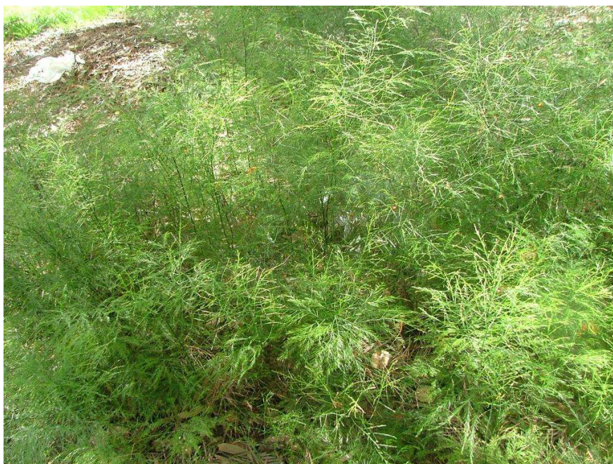
Asparagus Fern.

Asparagus Fern is an erect herb or shrub originally introduced as an ornamental plant. It is an emerging environmental weed over a wide range of coastal and sub-coastal habitats. It now occurs in coastal and sub-coastal Queensland and is especially common in the south-east of that state. In New South Wales Asparagus Fern is not widespread, but occurs mostly in the Sydney district. Asparagus Fern has the potential to invade a wide range of coastal and sub-coastal plant communities, in areas north from Sydney. It competes with native ground cover and understorey plants by forming dense infestations that smother other species and prevent their germination and establishment. It can form very large, continuous infestations.