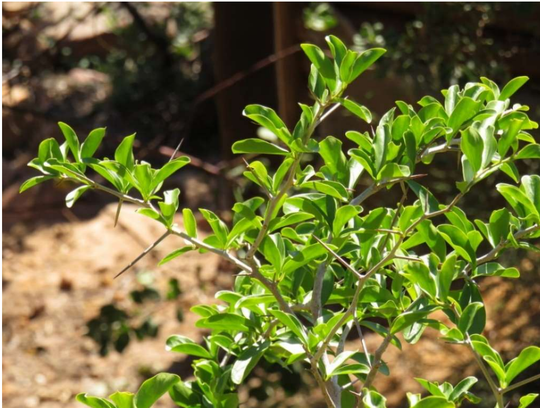
Kei apple.