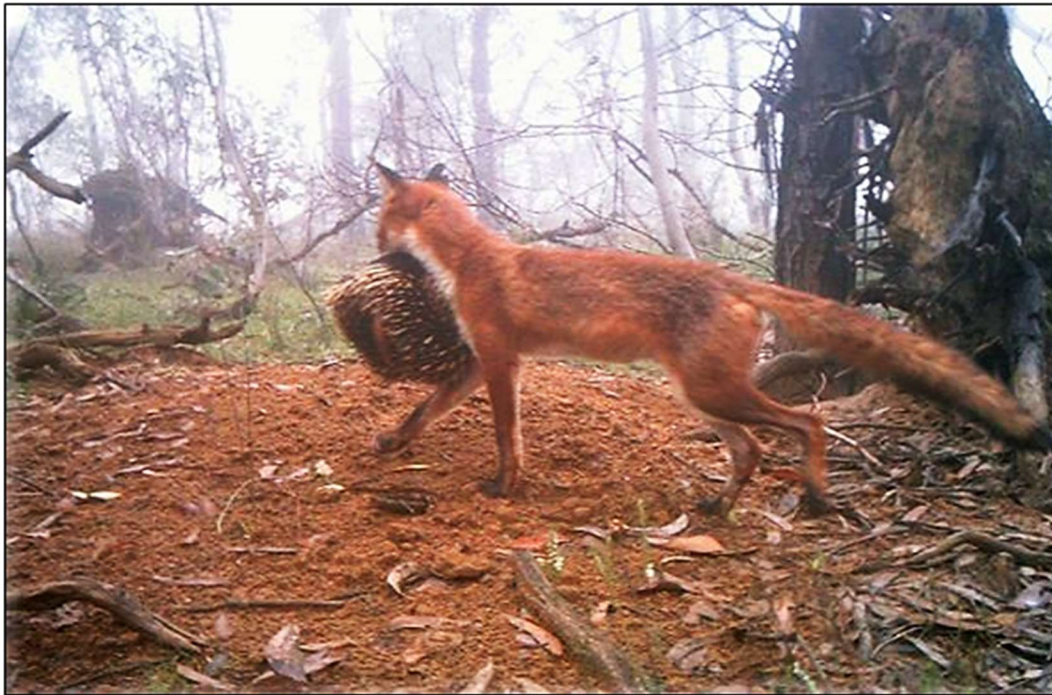
Foxes preying on native wildlife.