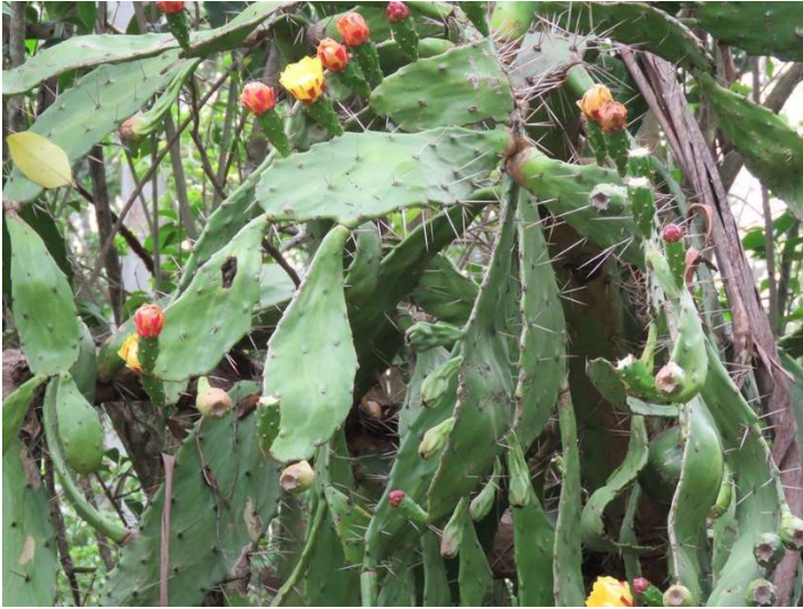
Smooth Tree Pear.

Smooth tree pear is an upright cactus up to 6 m tall though usually only 2 – 3 m. The stems have an obvious drooping appearance. It sometimes has a short woody trunk with clusters of large spines up to 10 cm long. Smooth tree pear is an invasive spiny cactus and is a WoNS. The spines can: