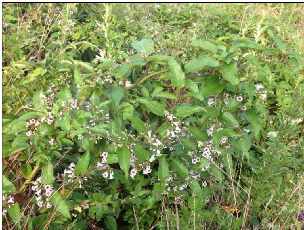
Skunk vine.