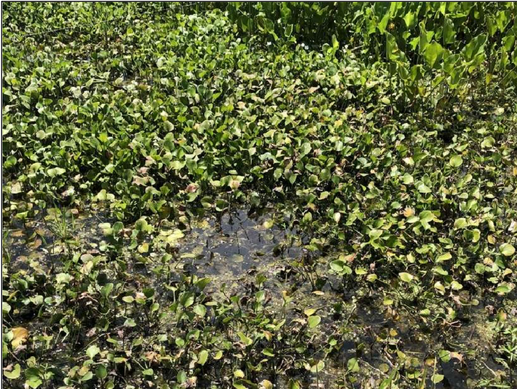
American frogbit.