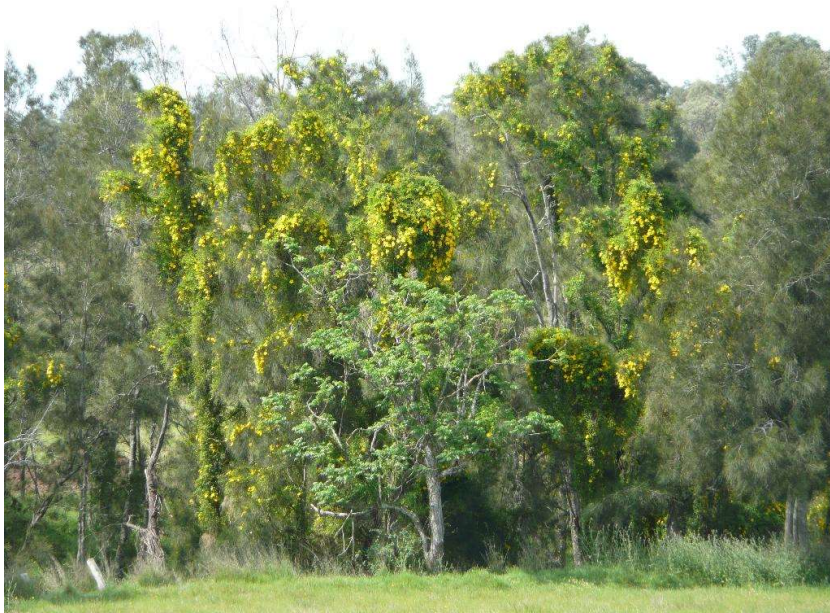
Cat's Claw Creeper.