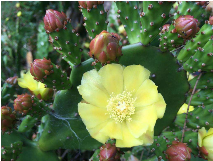
Smooth Tree Pear.