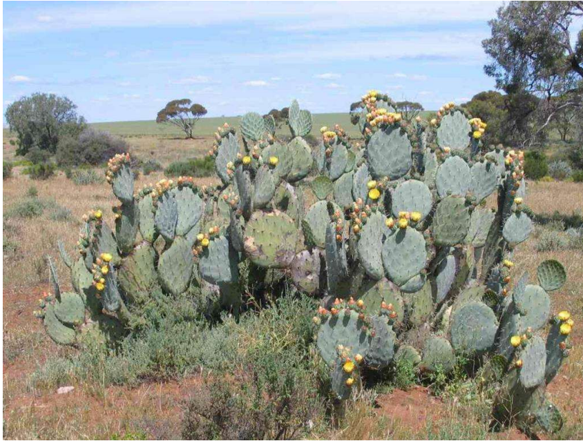
Wheel Cactus.

Wheel cactus is a succulent shrub usually 1–2 m tall with yellow flowers. Sometimes it is treelike with a distinct trunk and up to 4 m tall. Cacti pads have bumps on the surface called areoles. Spines, bristles, leaves, flowers, fruit, roots and new shoots all grow out of the areoles.