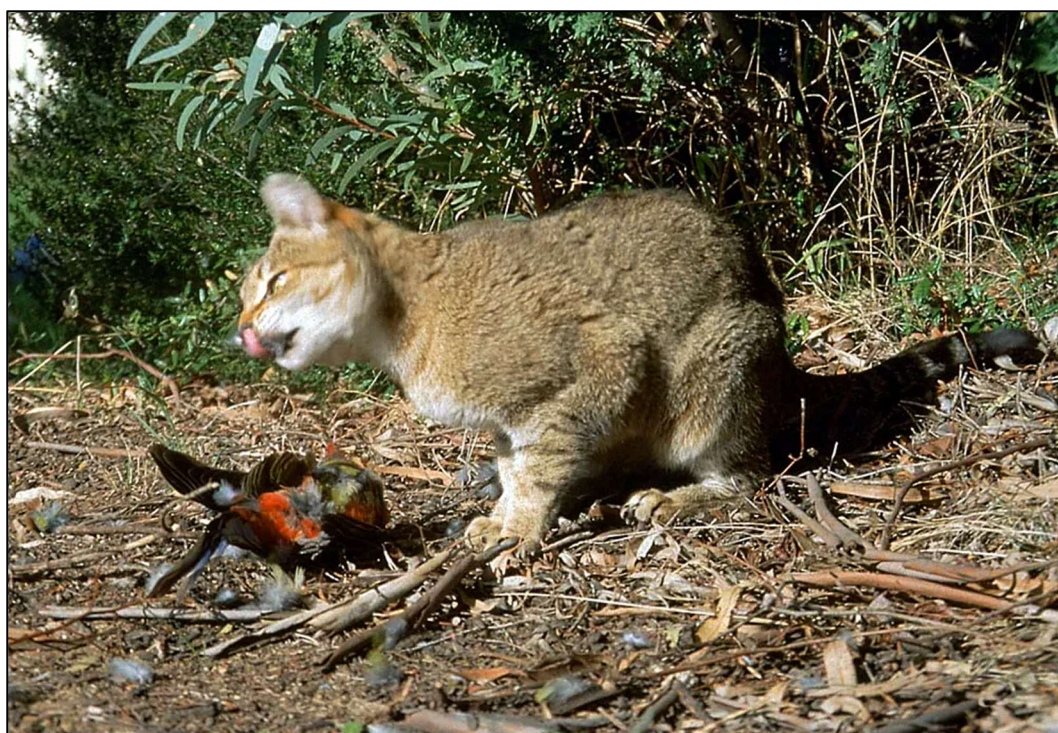
Feral cat.