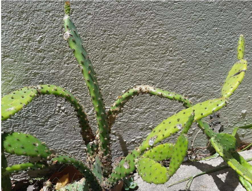
Chicken Dance Cactus.

Chicken dance cactus is an erect succulent shrub usually 0.7 to 1.8 m tall. It often has a trunk which may be up to 1 m tall. Chicken dance cactus has elongated fleshy pads with short spines and bristles. Chicken dance cactus competes with other plants. The sharp spines up to 1 cm long can: