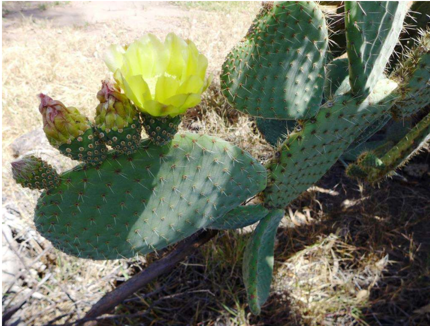
Aaron's Beard Prickly Pear.

Aaron's Beard Prickly Pear is a branched, succulent cactus that grows up to 2.5 m tall and often has a trunk. It has large succulent pads covered in white spines. Aaron's beard prickly pear can outcompete native plants, reducing food and habitat for native animals. It has sharp spines up to 5 cm long that: