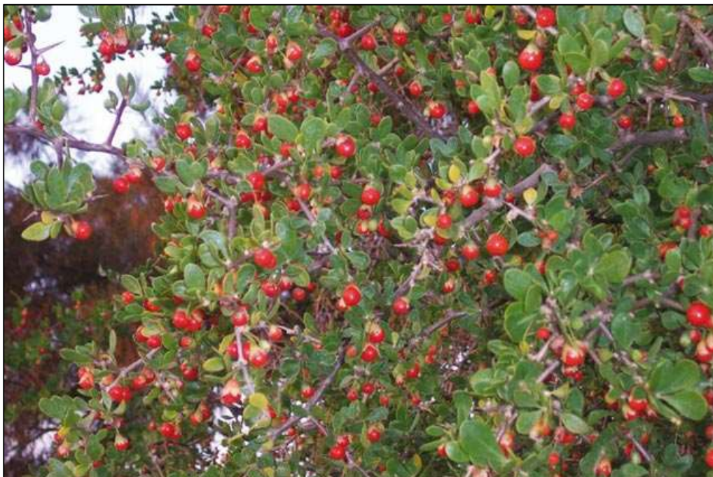
African Boxthorn.