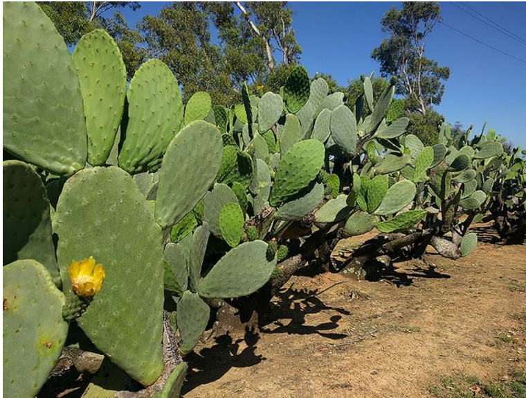
Indian Fig.

Indian Fig is a tree-like cactus up to 7 m tall with very few spines. It is the only Opuntia species that is permitted for sale in NSW. It is grown by gardeners for its edible fruit. Indian Fig has never caused any problems to rural production. It spreads slowly and is easily eradicated. It was removed from the list of prohibited plants in 1978.