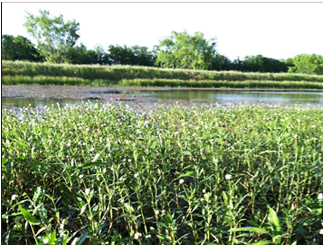
Alligator weed.