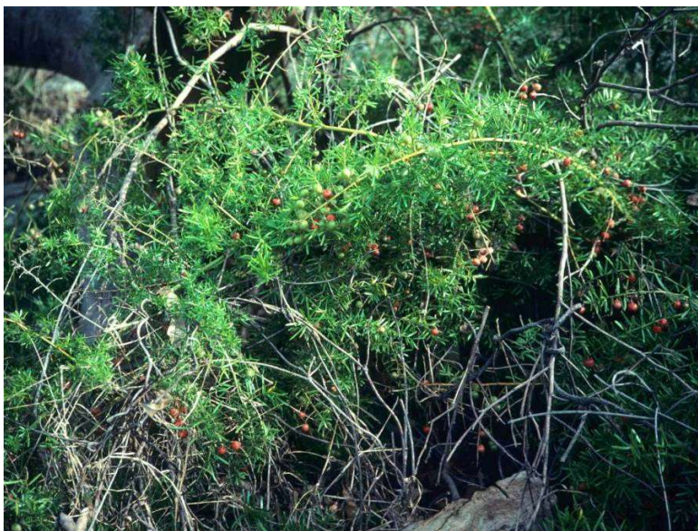
Ground Asparagus.