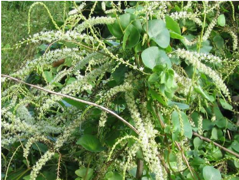
Madeira Vine.