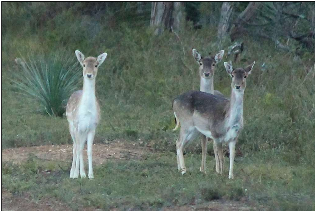
European fallow deer.