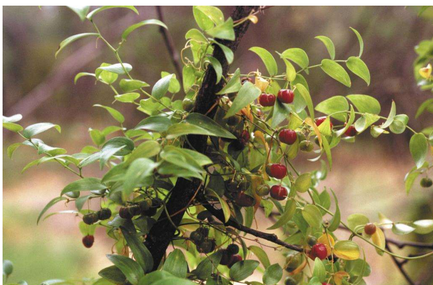
Bridal Creeper.

Bridal Creeper is a garden plant with climbing stems. It is now a major weed of bushland where it smothers native plants. Bridal Creeper is now a major weed of bushland in southern Australia, where its climbing stems and foliage smother native plants. It forms a thick mat of underground tubers which