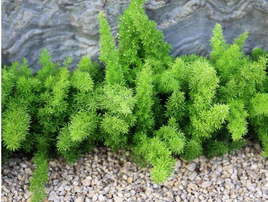
Foxtail Fern.

Foxtail Fern is a spreading ground cover with upright stems. It has dense foliage that look like foxtails and foliage and root mats that prevent other plants from growing. It is an ornamental plant that can invade native bushland. Foxtail Fern was previously included with Ground Asparagus, but has since been classed as a separate cultivar.