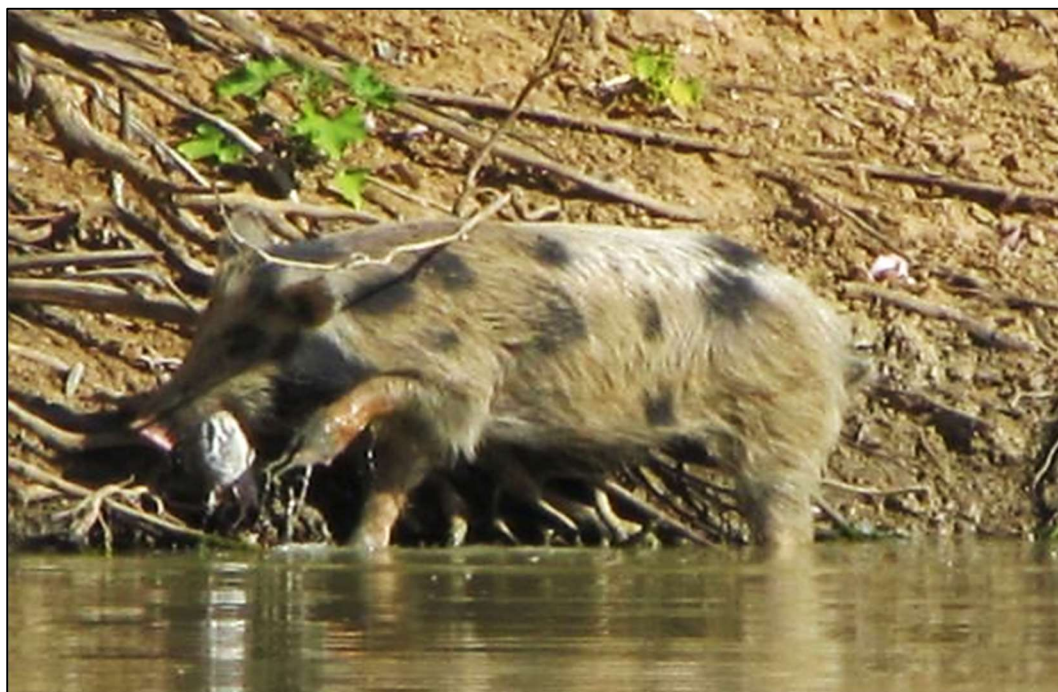
Feral Pig.