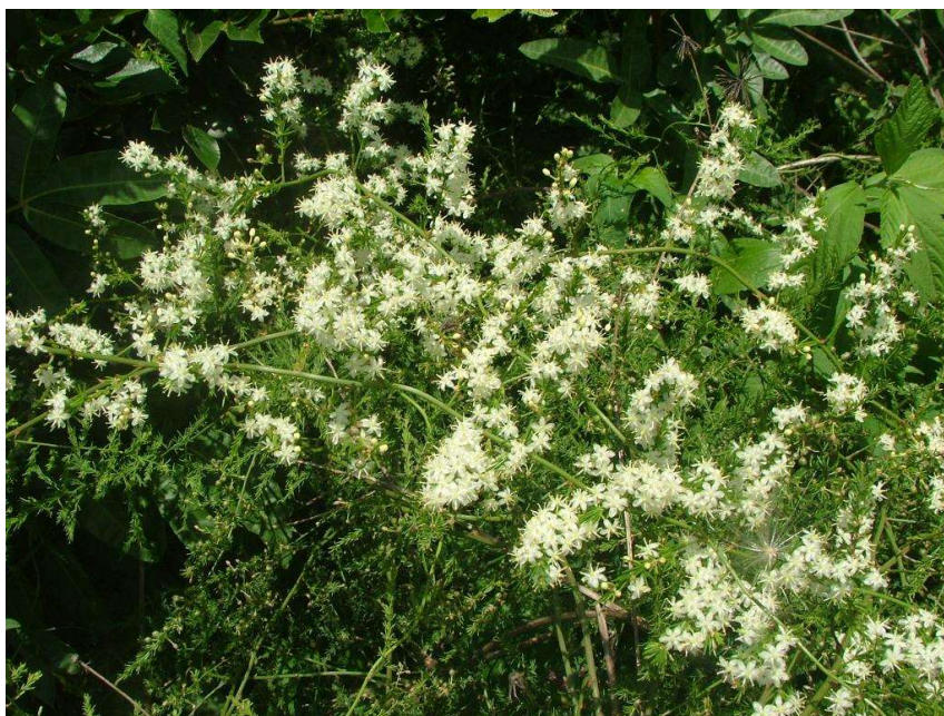
Climbing Asparagus.

Climbing Asparagus is a climber or low shrub originally introduced as an ornamental plant. It has the potential to invade a wide range of coastal and sub-coastal plant communities from Cape York to northern New South Wales, but has been recorded as far south as Sydney. It strongly competes with native ground cover and understorey plants by forming a dense mat of rhizomes and roots that can prevent the germination and establishment of other species. It can attain very large and continuous infestations.