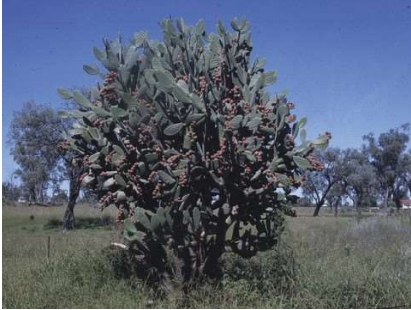
Velvety Tree Pear.

Velvety tree pear is a tree-like cactus whose pads are covered in fine velvety hairs. It outcompetes pasture grasses and native plants and is a WoNS. Velvety tree pear is an invasive cactus that: