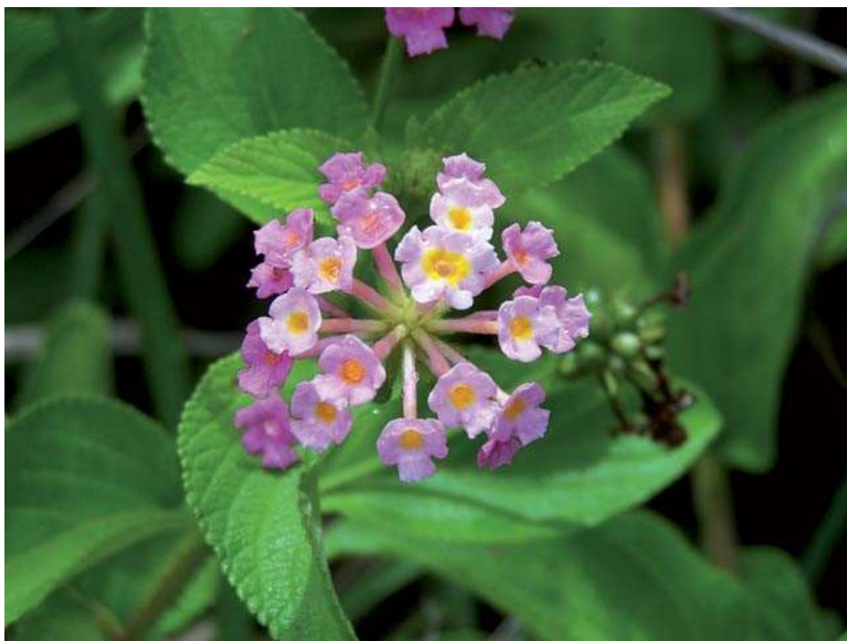
Lantana.