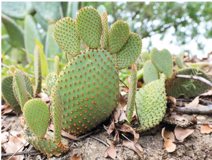
Blind Cactus.

Blind Cactus is a spineless cactus with pairs of pads which are covered in tufts of reddish-brown bristles. Blind cactus forms dense thickets and: