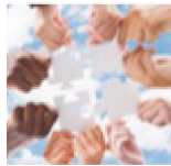
City Economy Team