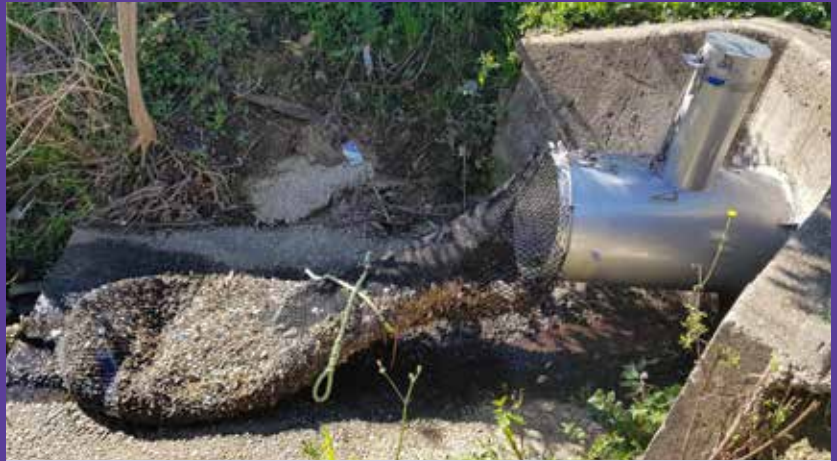
Net trap installed at a stormwater outlet in Warwick Farm.

Liverpool City Council recently installed three net type gross pollutant traps at stormwater outlets within the Local Government Area to prevent gross pollutants from entering waterways. These nets trap large pollutants such as bottles, cans, cups, organic matter and other litter while allowing water to flow through. The nets will be cleaned quarterly to ensure ongoing water quality improvement.