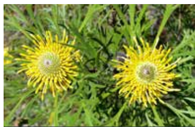
Broad-leaved drumsticks Isopogon anemonifolius