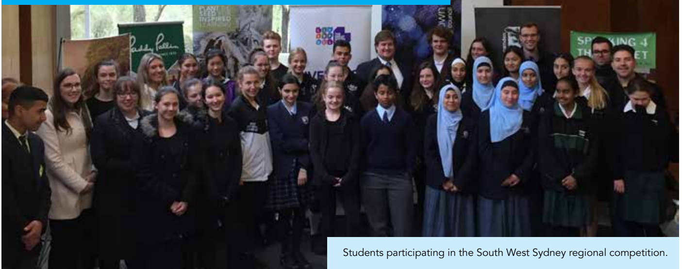
Students participating in the South West Sydney regional competition.

Speaking 4 the Planet (S4P) is a public speaking, drama and art competition for high school students which recognises and celebrates the United Nations' annual World Environment Day (WED). The competition aims to encourage young people to think creatively about ways to be sustainable and share them in a public forum.