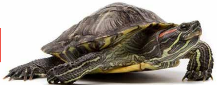
Red-eared slider turtle ( Trachemys scripta elegans )

Visit www.dpi.nsw.gov.au/REST for full details and a downloadable fact sheet.