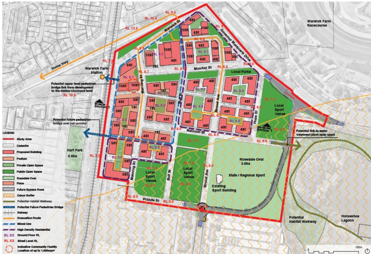
Figure 1: Draft Warwick Farm racing precinct structure plan: illustrates the proposed land use and development potential for land proposed to be rezoned.