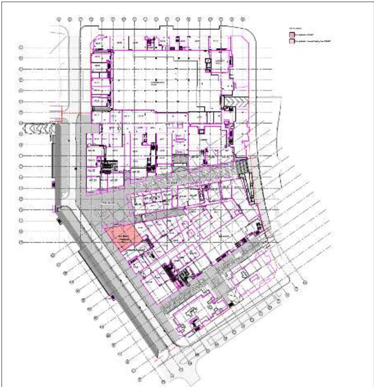
Locational Site Plan