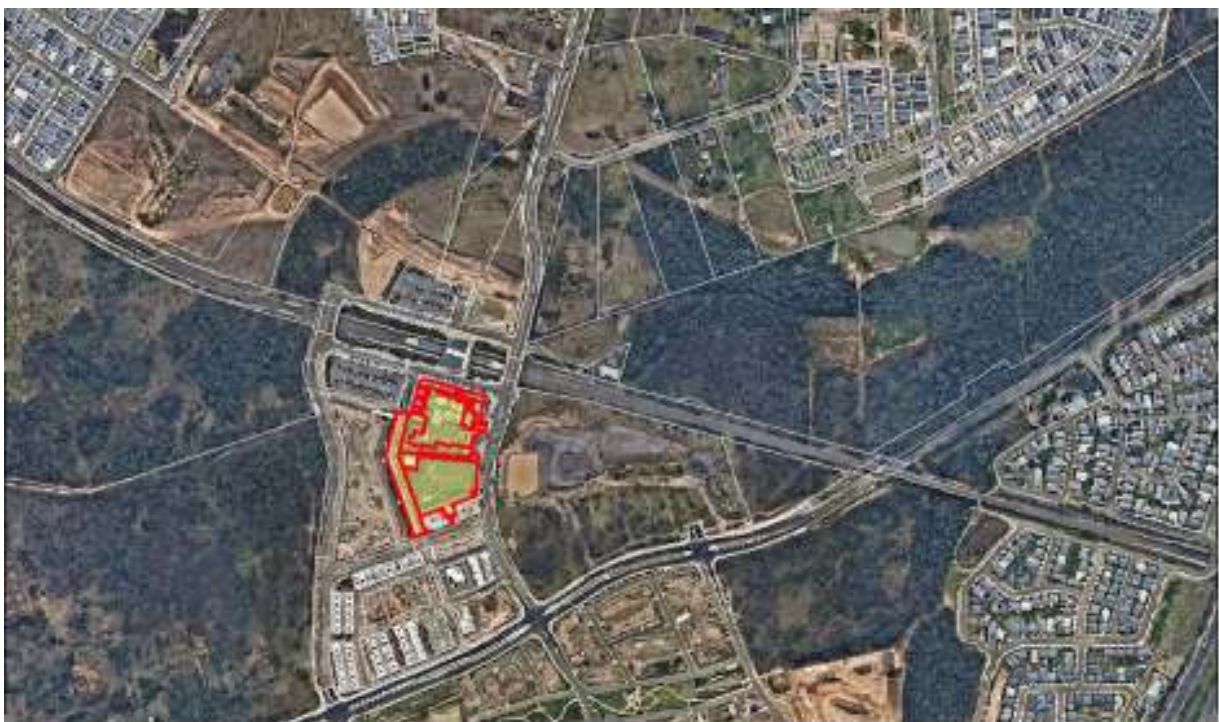
Figure 1: Locality Surrounding the Proposed Development

The site is located within Edmondson Park, which is categorised by the Town Centre which compromises of mixed-use development including residential accommodation and business precincts. The site is also located within a growth area subject to ongoing subdivision and development.