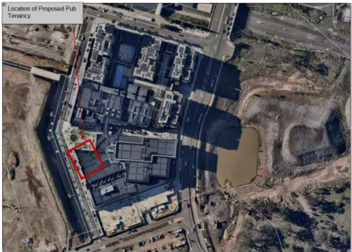
Figure 2: Aerial view of the site

has primary pedestrian access via the Town Square and adjoins a private road.