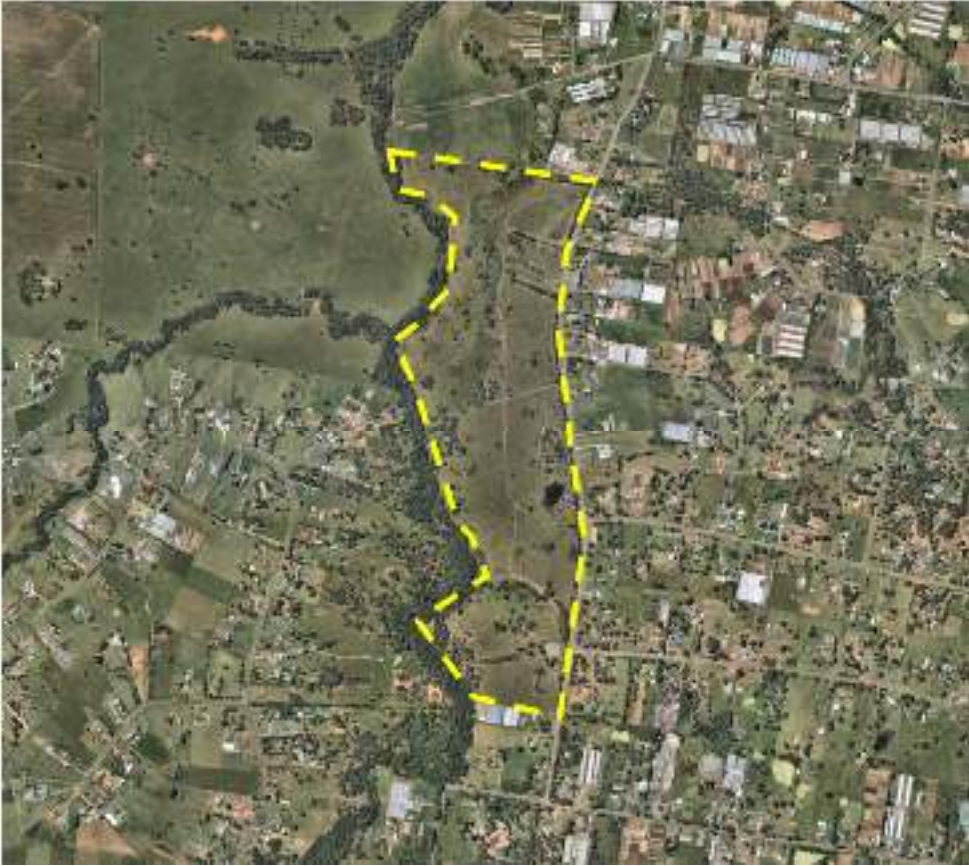
Figure 1: Aerial view of subject site