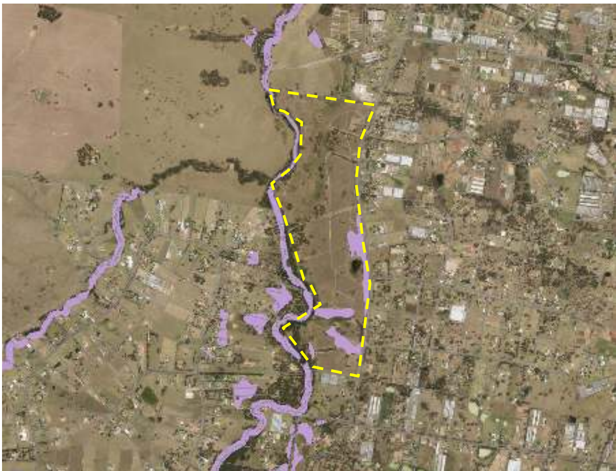
Figure 4: Land identified on the Biodiversity Values Map (DPIE)

The proposed facility would be predominantly located within cleared land and impacts to biodiversity will be minimised. It is also noted that the site is non-certified for the purposes of biodiversity conservation under the SEPP (Sydney Region Growth Centres) 2006. Some small portions of land are identified on the Biodiversity Values Map ( Figure 4 ), which forms part of the Biodiversity Offsets Scheme Threshold (under the Biodiversity Conservation Act 2016).