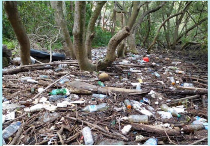
Rubbish along the Georges River.